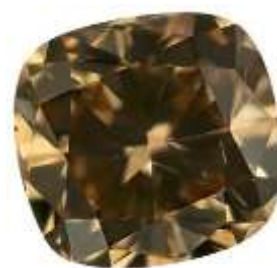
1.15 ct SI Medium Champagne C4