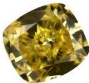
1.00 ct SI1 Fancy Intense Yellow (GIA)