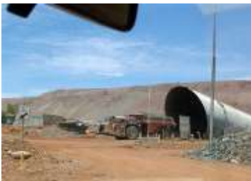
Portal to underground exploration level

In fact, this is good news for Kulsen & Hennig customers, as a large proportion of our champagne and pink coloured diamonds come from the Argyle mine .