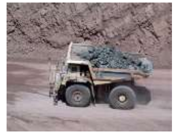
Green-grey lamproite ore. Background and ground: red-dish country rock mudstone