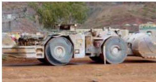
Low-profile ore excavation equipment