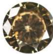
Reduced brilliance because the table is too large