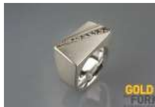
Engagement ring: silver ring with white gold and grey diamonds. © Gold und Form (Meersburg)

"Our customers are looking for something unique and they want their engagement ring and wedding bands to express that difference. The "traditional" American engagement ring, with the biggest possible diamond set on the smallest possible band, is rarely requested by our customers. Rather, they want a customized ring that fits their partner perfectly and says "you are exceptional"."