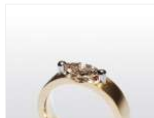
Left: engagement ring: yellow gold, white gold, champagne coloured navette diamond. Right: engagement ring: 750 yellow gold, cushion cut champagne coloured diamond.

"We like to suggest these unusual gems to our customers because they are very special. Someone looking for a diamond that is not too "flashy" is often delighted with the warm elegance of champagne diamonds."