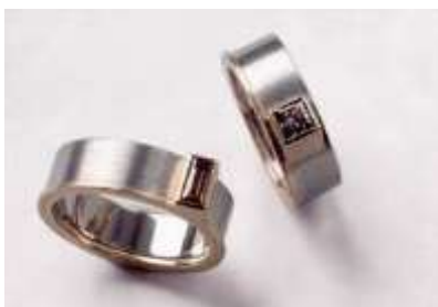
Wedding rings: 750 white and rose gold, baguettes and princess, cognac colour. © Atelier K. (Cologne)

"The key is to communicate. For me, white diamonds often create too hard of an effect. Natural Fancy Coloured Diamonds, especially champagne and cognac shades, blend more easily with different skin types."