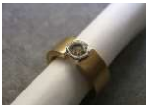
Engagement Rings: light champagne diamonds.

"Natural Fancy Coloured Diamonds make a charming and mysterious statement. For engagement rings, I like to suggest a light champagne coloured diamond as an alternative to a colourless diamond."