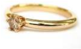
Engagement ring: pink diamond.

"Most of the time, couples want colourless diamonds for engagement rings; however, those customers who are looking for both a diamond and a touch of colour in their wedding rings are enthusiastic about the variety of colours offered by Natural Fancy Coloured Diamonds."