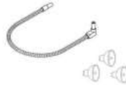
From left to right: Fiber optic light source Nossigem Fiberlite; glass fiber light conductor, single arm, flexible; cold light-reflector halogen bulbs