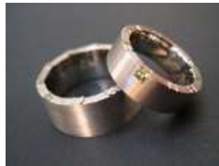
Wedding bands: 750 white gold, princess cut champagne colour. © Schmuckmanufaktur Kneist (Darmstadt)

"We appreciate the unusual character and unique diversity of colours of Natural Fancy Coloured Diamonds. Customers who place great value on individual expression like to break with tradition and opt for these extraordinary stones."