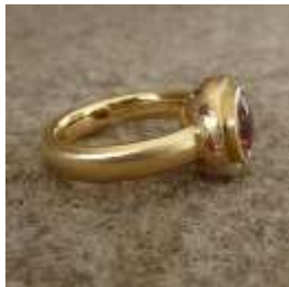
Engagement ring: 750 yellow gold, tourmaline, pink diamonds.

"I myself have a great passion for Natural Fancy Coloured Diamonds and have noticed a growing interest among my customers. Demand is increasing."