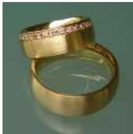
Wedding bands: 750 yellow gold, pink diamonds. © Form-Werk (Cologne)