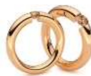
Niessing tension rings®: red gold, champagne diamonds.

"Engagement rings are definitely in fashion. We like to suggest Natural Fancy Coloured Diamonds to our customers as an alternative to colourless diamonds. For example, the warm tones of champagne diamonds blend beautifully with pink gold. Natural Fancy Coloured Diamonds have become indispensable to our range of products."