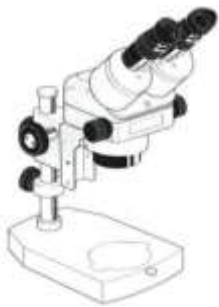
Microscope optics binocular Stereo Zoom

The Sortoscope®, developed by the Nossigem Company in Bonn, is a device similar to a microscope that allows the user to efficiently examine and sort even the smallest diamonds by purity, colour and cut. The results are much more precise and reliable than those obtained with a 10 X magnifying glass. Specially developed lighting technology makes it possible to examine the diamonds without reflexion.