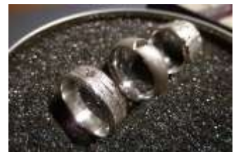
Engagement rings: "Cosy Rings" and cognac diamonds.