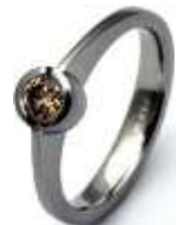
Engagement ring: 950 Palladium, diamond 0.24 ct, Fancy Brown

"When selecting stones, our customers are increasingly attracted to diamonds in general and to Natural Fancy Coloured Diamonds in particular. We think the pictures on our website speak for themselves."