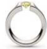
Niessing tension ring® Everest: platinum, Fancy Yellow diamond.