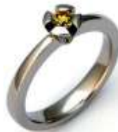
Engagement ring: 750 white gold, diamond 0.16 ct, Fancy Yellow

"When selecting stones, our customers are increasingly attracted to diamonds in general and to Natural Fancy Coloured Diamonds in particular. We think the pictures on our website speak for themselves."