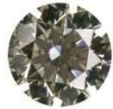
This diamond corresponds to our quality criteria