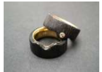
Wedding bands: 18 kt gold, ebony, Natural Fancy Coloured Diamond.