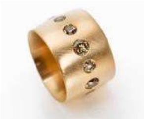
Engagement ring: 750 rose gold, champagne coloured diamonds. © Eva Niemand (Berlin)

"Eva Niemand: Longevity and inheritability are the main reasons why a couple chooses colourless diamonds, but Natural Fancy Coloured Diamonds are more than just that; they are unique, non-interchangeable pieces that blend perfectly with both the metal and the wearer."