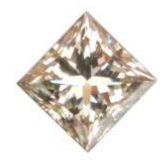
1. Brilliant / Fancy Grayish Pink Brown / 0,36 ct / VS / 4,49 - 4,51 x 2,80 mm 2. Brilliant / Fancy Deep Olive Green / 0,33ct / VS / 4,35 - 4,36 x 2,74 mm 3. Princess / C2 / 0.52 ct / VVS / 4,61 x 4,60 x 3,01 mm